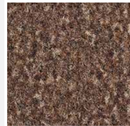
Kestrel LRV 5.42