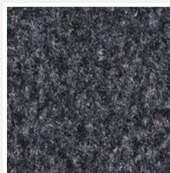
Moorhen LRV 2.98