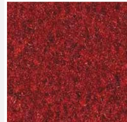
Redpoll LRV 4.14