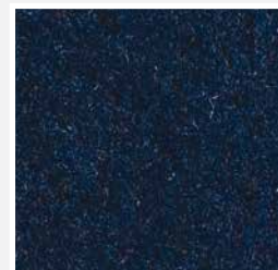
Swallow LRV 2.08