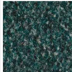
Shelduck LRV 5.20