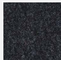
Jackdaw LRV 1.73