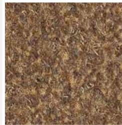
Corncrake LRV 9.52