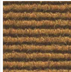
Terra LRV 10.89