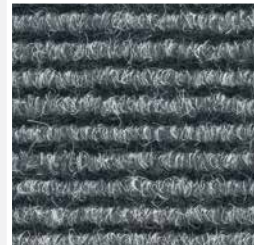
Calculus LRV 9.03