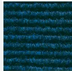
Marinus LRV 2.71